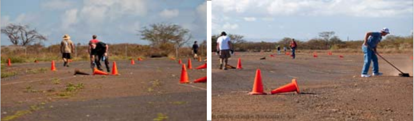
“When perfection is not attainable, do the best you can with what you have to work with.”